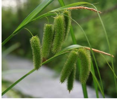
Carex comosa Bristly Sedge

HEIGHT: 2' to 3' TYPE: Sedge HARDINESS: Zone 4 to 8 BLOOM COLOR: Green BLOOM PERIOD: July to August FALL LEAF COLOR: Green NATIVE: Yes