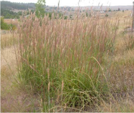
LOCATION: Rolling Dunescape, Main Entry