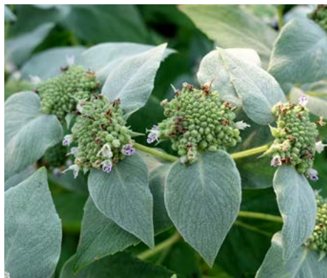
Pycnanthemum muticum Big Leaf Mountain Mint

HEIGHT: 3' to 4' TYPE: Broadleaf Perennial HARDINESS: Zone 4 to 8 BLOOM COLOR: White BLOOM PERIOD: July to September NATIVE: Yes