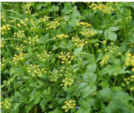
LOCATION: Main Entry

HEIGHT: 3' to 6' TYPE: Broadleaf Perennial HARDINESS: Zone 3 to 8 BLOOM COLOR: White BLOOM PERIOD: June to August NATIVE: Yes