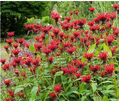
LOCATION: Andre Brook, Main Entry, Northern Buffer