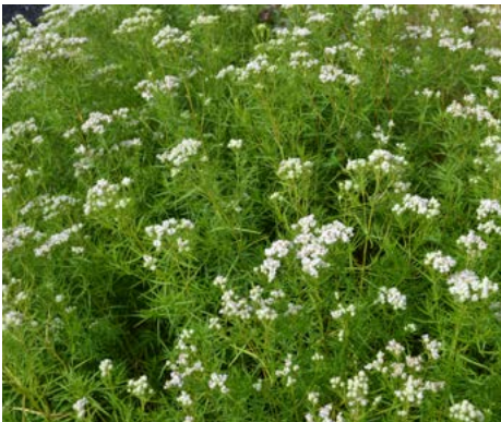
LOCATION: Andre Brook, Rolling Dunescape, Northern Buffer

HEIGHT: 3' to 4' TYPE: Broadleaf Perennial HARDINESS: Zone 4 to 8 BLOOM COLOR: White BLOOM PERIOD: July to September NATIVE: Yes