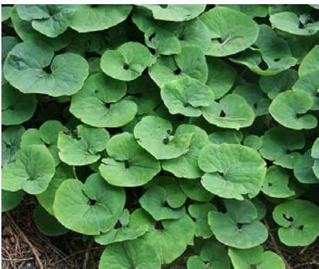
LOCATION: Picnic Grove

HEIGHT: 1' to 2' TYPE: Broadleaf Perennial HARDINESS: Zone 3 to 8 BLOOM COLOR: Yellow to Red BLOOM PERIOD: May to July NATIVE: Yes