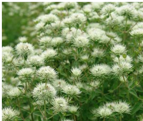
Pycnanthemum flexuosum Appalachian Mountain Mint

HEIGHT: 2' to 3' TYPE: Broadleaf Perennial HARDINESS: Zone 6 to 8 BLOOM COLOR: White BLOOM PERIOD: July to September NATIVE: Yes