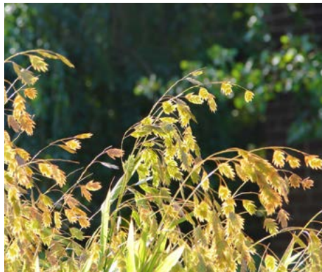
Chasmanthium latifolium River Oats

HEIGHT: 4' TYPE: Grass HARDINESS: Zone 3 to 8 BLOOM COLOR: Purple Bronze BLOOM PERIOD: July to September FALL LEAF COLOR: Copper NATIVE: Yes