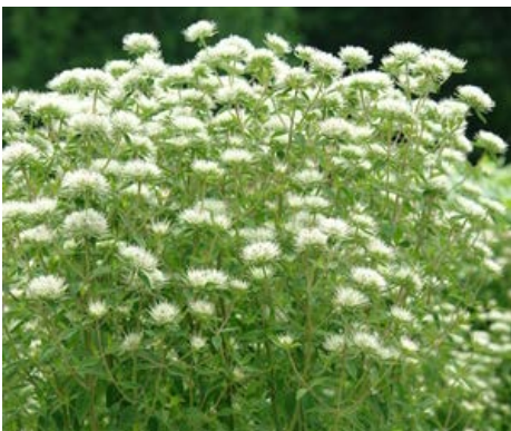
LOCATION: Andre Brook

HEIGHT: 3' to 4' TYPE: Broadleaf Perennial HARDINESS: Zone 3 to 7 BLOOM COLOR: White BLOOM PERIOD: May to June NATIVE: Yes