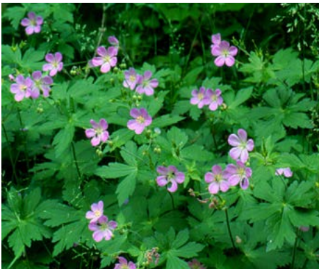
LOCATION: Andre Brook

HEIGHT: 2' to 3' TYPE: Broadleaf Perennial HARDINESS: Zone 3 to 8 BLOOM COLOR: White BLOOM PERIOD: July to August NATIVE: Yes