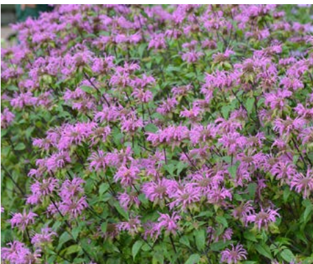
LOCATION: Rain Gardens, Southwest Shore, Northern Buffer