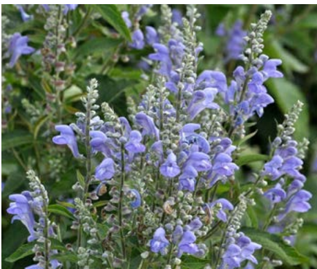
LOCATION: Andre Brook, Northern Buffer

HEIGHT: 2' to 5' TYPE: Broadleaf Perennial HARDINESS: Zone 5 to 9 BLOOM COLOR: Blue BLOOM PERIOD: July to September NATIVE: Yes