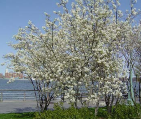
LOCATION: Path Edge, Rolling Dunescape