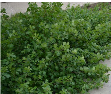
LOCATION: Path Edge, Rolling Dunescape, Rain Gardens