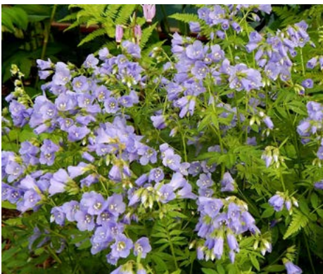
LOCATION: Main Entry

HEIGHT: 2' to 4' TYPE: Broadleaf Perennial HARDINESS: Zone 3 to 9 BLOOM COLOR: Pink BLOOM PERIOD: July to October NATIVE: Native Cultivar