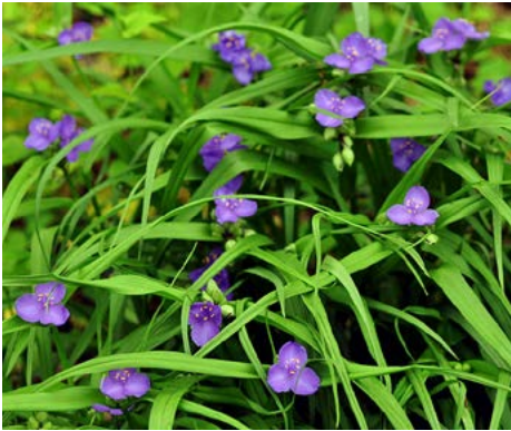
LOCATION: Rolling Dunescape, Main Entry