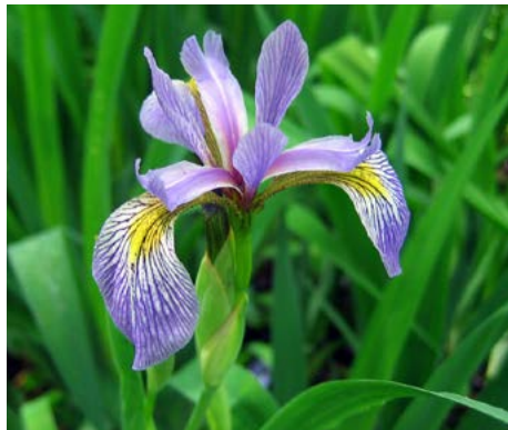
Iris versicolor Blue Flag Iris

HEIGHT: 3' to 4' TYPE: Broadleaf Perennial HARDINESS: Zone 3 to 9 BLOOM COLOR: Blue Violet BLOOM PERIOD: May to July NATIVE: Yes