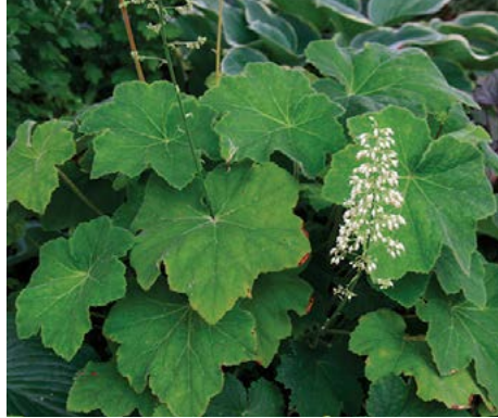
Heuchera villosa 'Autumn Bride' Hairy Alumroot

HEIGHT: 10" to 18" TYPE: Broadleaf Perennial HARDINESS: Zone 3 to 8 BLOOM COLOR: White BLOOM PERIOD: July to October NATIVE: Native Cultivar