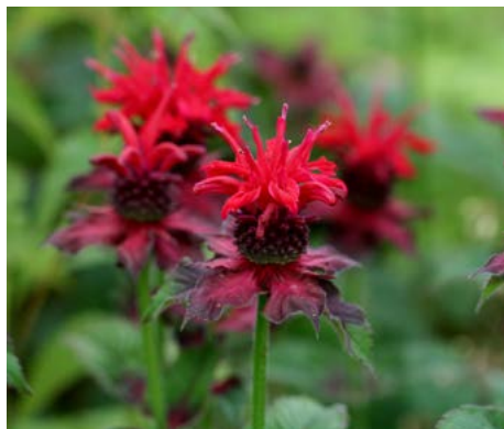
Monarda x 'Fireball' Oswego Tea

HEIGHT: 1' to 2' TYPE: Broadleaf Perennial HARDINESS: Zone 4 to 8 BLOOM COLOR: Red BLOOM PERIOD: June to July NATIVE: Native Cultivar