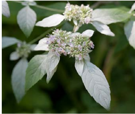
Pycnanthemum incanum Mountain Mint

HEIGHT: 3' to 4' TYPE: Broadleaf Perennial HARDINESS: Zone 4 to 8 BLOOM COLOR: White BLOOM PERIOD: July to September NATIVE: Yes