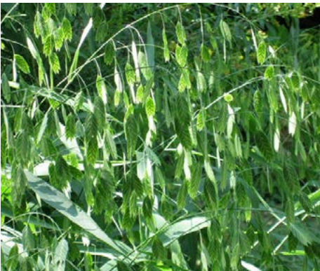
LOCATION: Main Entry, Northern Buffer

HEIGHT: 1' to 2' TYPE: Sedge HARDINESS: Zone 4 to 9 BLOOM COLOR: Yellow BLOOM PERIOD: June to July FALL LEAF COLOR: Green NATIVE: Yes