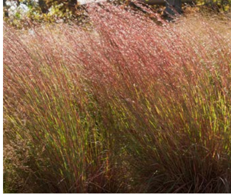
Schizachyrium scoparium Little Bluestem

HEIGHT: 2' to 4' TYPE: Grass HARDINESS: Zone 3 to 9 BLOOM COLOR: Purplish Bronze BLOOM PERIOD: August to September FALL LEAF COLOR: Yellow Orange NATIVE: Yes