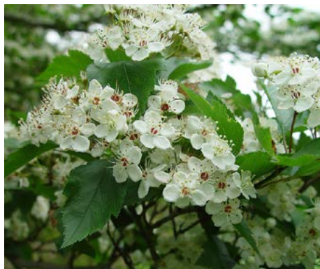
Crataegus viridis 'Winter King' Green Hawthorn

HEIGHT: 25' to 30' TYPE: Deciduous Tree HARDINESS: Zone 4 to 7 BLOOM COLOR: White BLOOM PERIOD: May to June FALL LEAF COLOR: Orange Red NATIVE: Native Cultivar