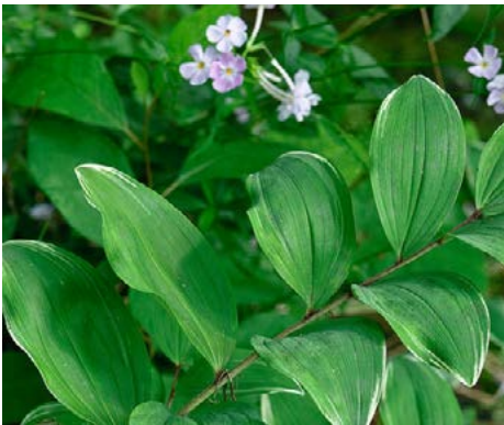
LOCATION: Main Entry

HEIGHT: 12" to 14" TYPE: Broadleaf Perennial HARDINESS: Zone 3 to 8 BLOOM COLOR: Blue BLOOM PERIOD: May to June NATIVE: Yes