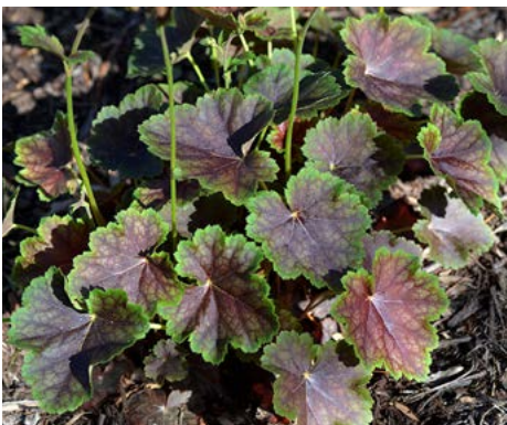
LOCATION: Main Entry

HEIGHT: 1' TYPE: Broadleaf Perennial HARDINESS: Zone 3 to 8 BLOOM COLOR: Pink BLOOM PERIOD: May to June NATIVE: Yes