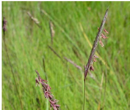
Spartina patens Salt Hay

HEIGHT: 2' TYPE: Grass HARDINESS: Zone 4 to 10 BLOOM COLOR: Yellow BLOOM PERIOD: June to October FALL LEAF COLOR: Yellow Orange NATIVE: Yes