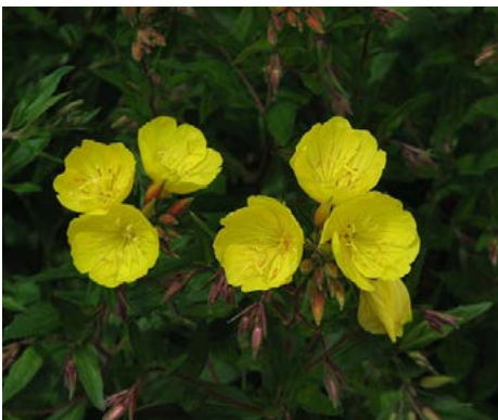
LOCATION: Andre Brook, Rolling Dunescape, Southwest Shore

HEIGHT: 6" to 12" TYPE: Broadleaf Perennial HARDINESS: Zone 4 to 8 BLOOM COLOR: Yellow BLOOM PERIOD: May to July NATIVE: Native Cultivar