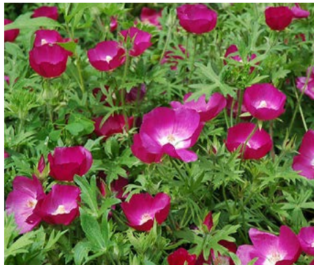
Callirhoe involucrata Wine Cups

HEIGHT: 1' to 2' TYPE: Broadleaf Perennial HARDINESS: Zone 4 to 8 BLOOM COLOR: Pink BLOOM PERIOD: June to August NATIVE: Yes