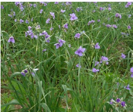
LOCATION: Path Islands

HEIGHT: 6" to 12" TYPE: Broadleaf Perennial HARDINESS: Zone 4 to 8 BLOOM COLOR: Blue BLOOM PERIOD: May to June NATIVE: Native Cultivar