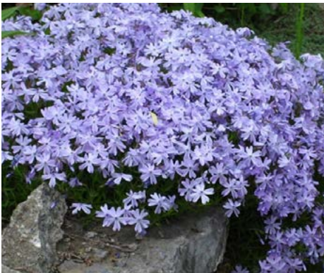
LOCATION: Andre Brook, Main Entry

HEIGHT: 2' to 5' TYPE: Broadleaf Perennial HARDINESS: Zone 5 to 9 BLOOM COLOR: Pink BLOOM PERIOD: August to September NATIVE: Native Cultivar