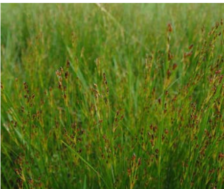
LOCATION: Andre Brook