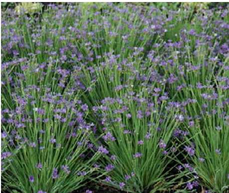
LOCATION: Path Edge

HEIGHT: 2' to 3' TYPE: Broadleaf Perennial HARDINESS: Zone 5 to 8 BLOOM COLOR: Blue BLOOM PERIOD: July to September NATIVE: Yes