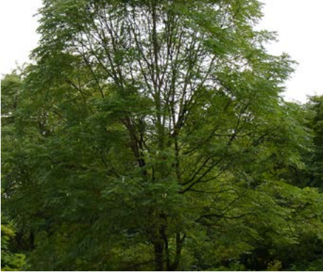
LOCATION: Andre Brook