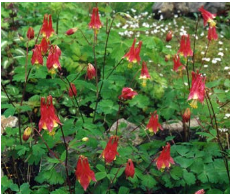
LOCATION: Picnic Grove

HEIGHT: 10" TYPE: Broadleaf Perennial HARDINESS: Zone 4 to 9 BLOOM COLOR: Lavender Blue BLOOM PERIOD: May to June NATIVE: Native Cultivar ATTRIBUTE: Yellow Fall Color