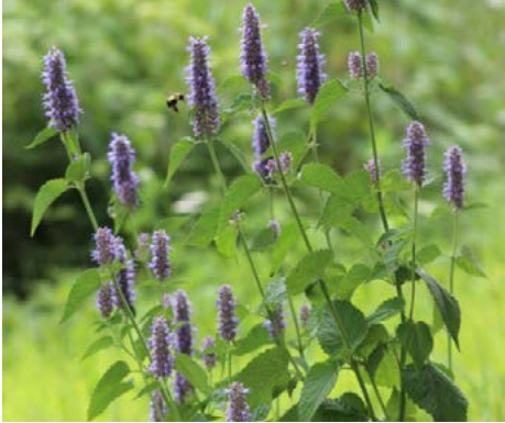
LOCATION: Rolling Dunescape