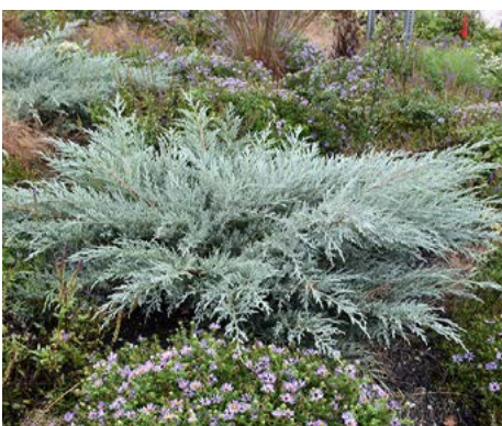
LOCATION: Path Edge