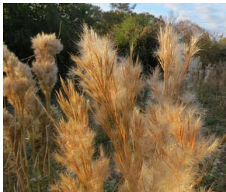
Andropogon glomeratus Bushy Beardgrass

HEIGHT: 2' to 4' TYPE: Grass HARDINESS: Zone 5 to 9 BLOOM COLOR: White BLOOM PERIOD: September FALL LEAF COLOR: Coppery Orange NATIVE: Yes