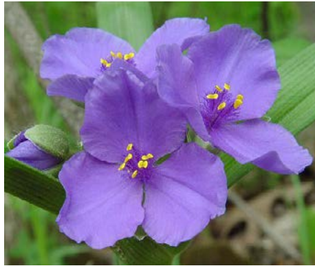
Tradescantia virginiana Virginia Spiderwort

HEIGHT: 2' to 3' TYPE: Broadleaf Perennial HARDINESS: Zone 4 to 9 BLOOM COLOR: Blue Violet BLOOM PERIOD: May to June NATIVE: Yes