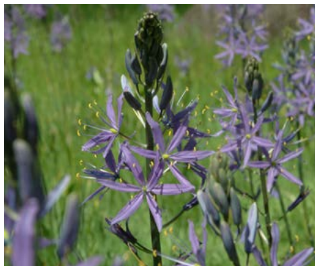
Camassia leichtlinii Great Camas

HEIGHT: 3' - 4' TYPE: Broadleaf Perennial HARDINESS: Zone 5 to 9 BLOOM COLOR: Blue BLOOM PERIOD: April to May NATIVE: Yes