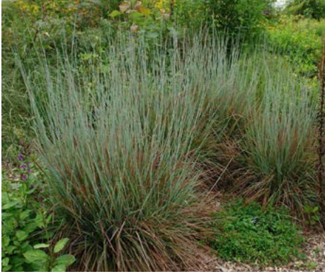
LOCATION: Andre Brook, Path Edge, Main Entry, Rolling Dunescape, Path Islands, Bulkhead Mantle, Southwest Shore, Northern Buffer