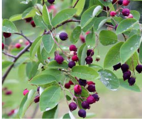
Amelanchier canadensis Shadblow Serviceberry existing

HEIGHT: 25' to 35' TYPE: Deciduous Tree HARDINESS: Zone 4 to 8 BLOOM COLOR: White BLOOM PERIOD: April to May FALL LEAF COLOR: Orange NATIVE: Yes