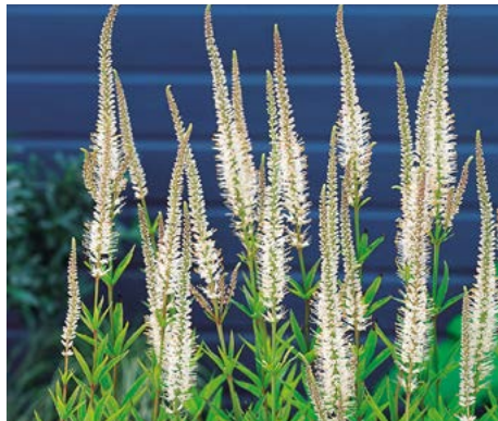
Veronicastrum virginicum Culver's Root

HEIGHT: 3' to 6' TYPE: Broadleaf Perennial HARDINESS: Zone 3 to 8 BLOOM COLOR: White BLOOM PERIOD: June to August NATIVE: Yes