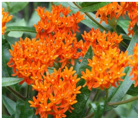
Asclepias tuberosa Butterflyweed

HEIGHT: 2' to 3' TYPE: Broadleaf Perennial HARDINESS: Zone 3 to 9 BLOOM COLOR: Orange BLOOM PERIOD: June to July NATIVE: Yes