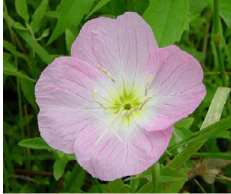
Oenothera speciosa Showy Evening Primrose

HEIGHT: 2' to 3' TYPE: Broadleaf Perennial HARDINESS: Zone 4 to 9 BLOOM COLOR: White to Pink BLOOM PERIOD: May to July NATIVE: Yes