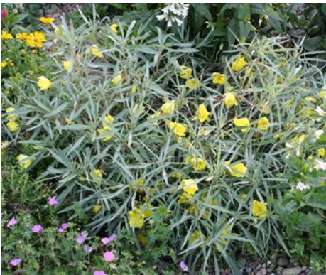
LOCATION: Rolling Dunescape

HEIGHT: 1' to 2' TYPE: Broadleaf Perennial HARDINESS: Zone 4 to 8 BLOOM COLOR: Red BLOOM PERIOD: June to July NATIVE: Native Cultivar