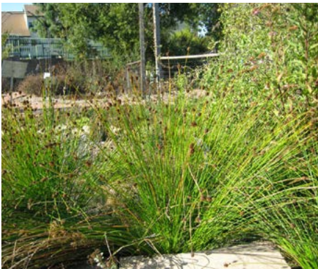
LOCATION: Andre Brook