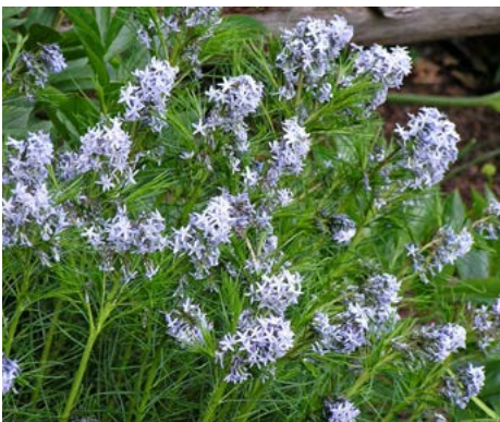
LOCATION: Rolling Dunescape

HEIGHT: 2' TYPE: Broadleaf Perennial HARDINESS: Zone 5 to 9 BLOOM COLOR: Pale Blue BLOOM PERIOD: May to June NATIVE: Yes ATTRIBUTE: Yellow Fall Color