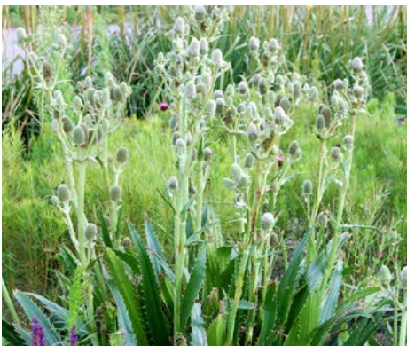
LOCATION: Andre Brook, Rolling Dunescape, Bulkhead Mantle

HEIGHT: 3' TYPE: Broadleaf Perennial HARDINESS: Zone 3 to 8 BLOOM COLOR: Pink BLOOM PERIOD: August to September NATIVE: Native Cultivar