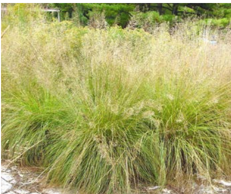
LOCATION: Rolling Dunescape, Path Islands

HEIGHT: 2' TYPE: Grass HARDINESS: Zone 4 to 10 BLOOM COLOR: Yellow BLOOM PERIOD: June to October FALL LEAF COLOR: Yellow Orange NATIVE: Yes