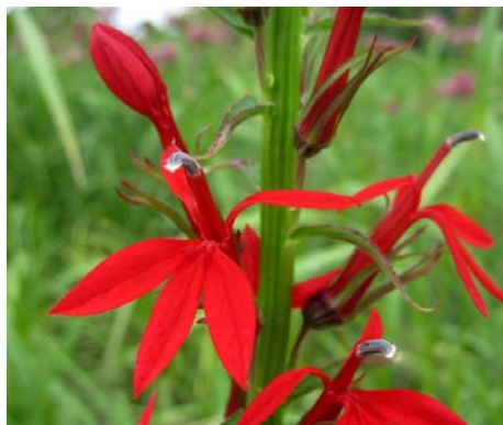
Lobelia cardinalis Cardinal Flower

HEIGHT: 2' to 4' TYPE: Broadleaf Perennial HARDINESS: Zone 3 to 9 BLOOM COLOR: Red BLOOM PERIOD: August to September NATIVE: Yes