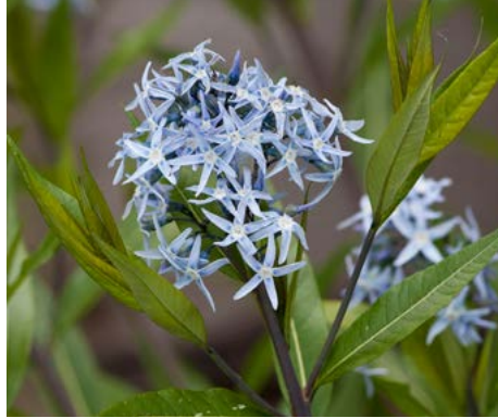
Amsonia tabernaemontana Eastern Bluestar

HEIGHT: 3' to 4' TYPE: Broadleaf Perennial HARDINESS: Zone 3 to 9 BLOOM COLOR: Pale Blue BLOOM PERIOD: May to June NATIVE: Yes ATTRIBUTE: Yellow Fall Color