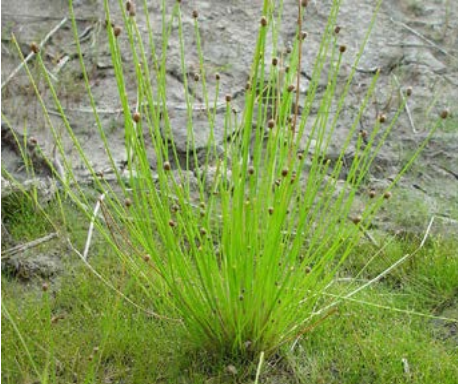
LOCATION: Andrew Brook