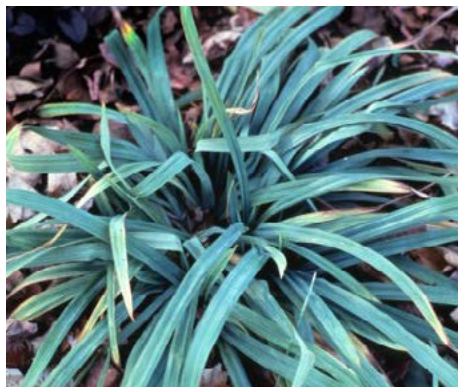
Carex flaccosperma Wood Sedge

HEIGHT: 6" to 10" TYPE: Sedge HARDINESS: Zone 5 to 8 BLOOM COLOR: Green BLOOM PERIOD: May to June FALL LEAF COLOR: Green NATIVE: Yes