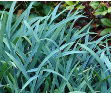
LOCATION: Main Entry

HEIGHT: 6" TYPE: Sedge HARDINESS: Zone 2 to 8 BLOOM COLOR: Green BLOOM PERIOD: April to May FALL LEAF COLOR: Green NATIVE: Yes