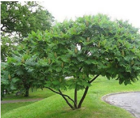
LOCATION: Rolling Dunescape