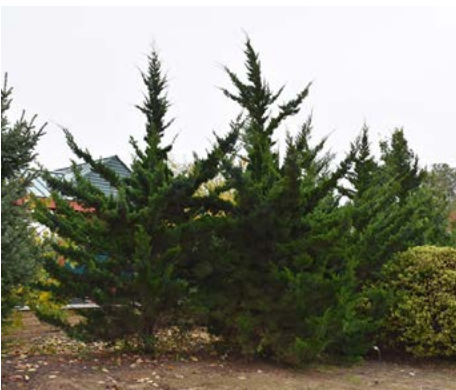
LOCATION: Path Edge, Rolling Dunescape

HEIGHT: 75' to 100' TYPE: Deciduous Tree HARDINESS: Zone 3 to 8 BLOOM COLOR: White BLOOM PERIOD: June FALL LEAF COLOR: Yellow NATIVE: Native Cultivar