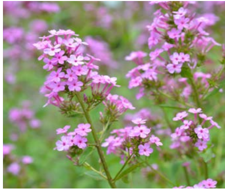
Phlox paniculata 'Jeana' Summer Phlox

HEIGHT: 2' to 3' TYPE: Broadleaf Perennial HARDINESS: Zone 4 to 8 BLOOM COLOR: Pink BLOOM PERIOD: July to September NATIVE: Native Cultivar