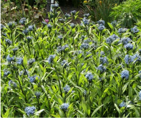
LOCATION: Andre Brook