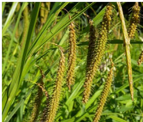
Carex crinita Fringed Sedge

HEIGHT: 1' to 3' TYPE: Sedge HARDINESS: Zone 3 to 8 BLOOM COLOR: Green BLOOM PERIOD: May to June FALL LEAF COLOR: Green NATIVE: Yes