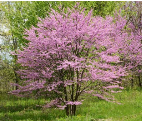
LOCATION: Path Edge, Rolling Dunescape, Rain Gardens

HEIGHT: 50' to 75' TYPE: Deciduous Tree HARDINESS: Zone 4 to 9 BLOOM COLOR: Yellow Green BLOOM PERIOD: April to May FALL LEAF COLOR: Yellow NATIVE: Yes