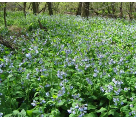
LOCATION: Picnic Grove