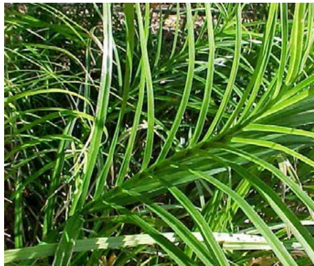
Carex muskingumensis Muskingum Sedge

HEIGHT: 1' to 2' TYPE: Sedge HARDINESS: Zone 4 to 9 BLOOM COLOR: Yellow BLOOM PERIOD: June to July FALL LEAF COLOR: Green NATIVE: Yes