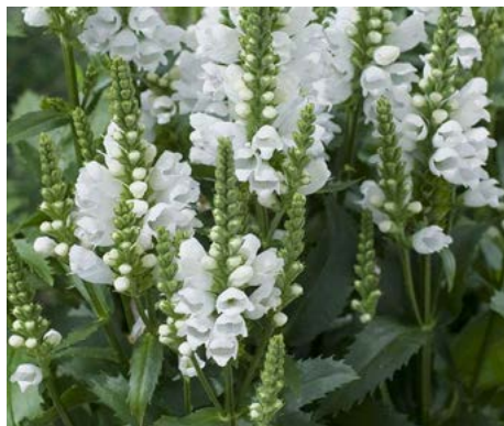
Physostegia virginiana 'Miss Manners' Obedient Plant

HEIGHT: 2' to 4' TYPE: Broadleaf Perennial HARDINESS: Zone 3 to 9 BLOOM COLOR: White BLOOM PERIOD: July to October NATIVE: Native Cultivar