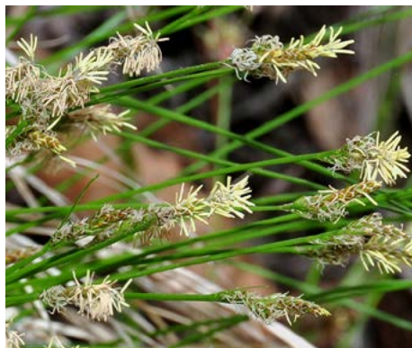
Carex albicans White-Tinged Sedge

HEIGHT: 12" to 18" TYPE: Sedge HARDINESS: Zone 4 to 8 BLOOM COLOR: Green BLOOM PERIOD: May FALL LEAF COLOR: Green NATIVE: Yes