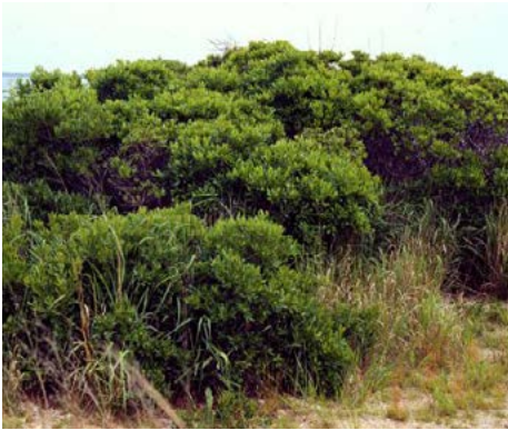
LOCATION: Southwest Shore