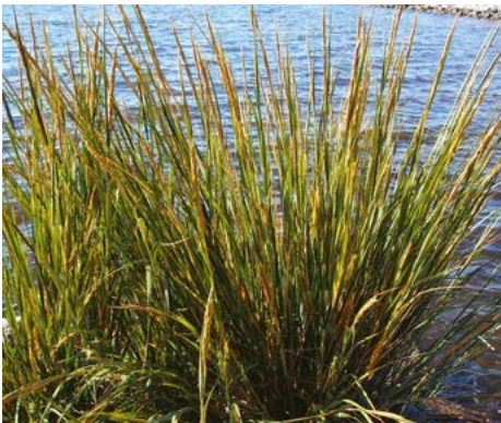
LOCATION: Andre Brook

HEIGHT: 2' to 4' TYPE: Grass HARDINESS: Zone 3 to 9 BLOOM COLOR: Purplish Bronze BLOOM PERIOD: August to September FALL LEAF COLOR: Yellow Orange NATIVE: Yes