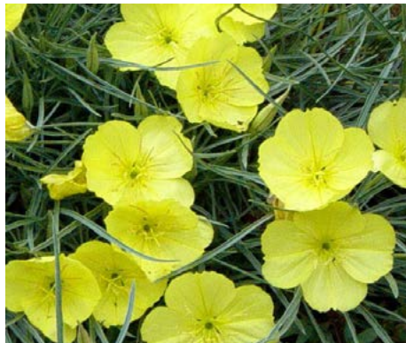
Oenothera macrocarpa ssp. fremontii 'Shimmer' Evening Primrose

HEIGHT: 6" to 12" TYPE: Broadleaf Perennial HARDINESS: Zone 4 to 8 BLOOM COLOR: Yellow BLOOM PERIOD: May to July NATIVE: Native Cultivar