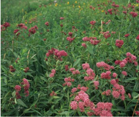
LOCATION: Rain Gardens