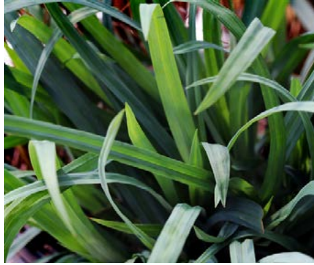
Carex laxiculmis Spreading Sedge

HEIGHT: 6" to 8" TYPE: Sedge HARDINESS: Zone 4 to 7 BLOOM COLOR: Green BLOOM PERIOD: May to June FALL LEAF COLOR: Green NATIVE: Yes