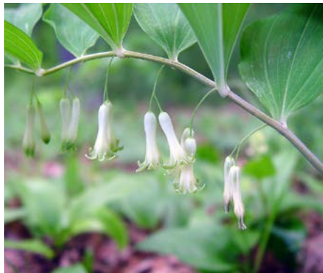
Polygonatum biflorum Giant Solomon's Seal

HEIGHT: 3' to 4' TYPE: Broadleaf Perennial HARDINESS: Zone 3 to 7 BLOOM COLOR: White BLOOM PERIOD: May to June NATIVE: Yes