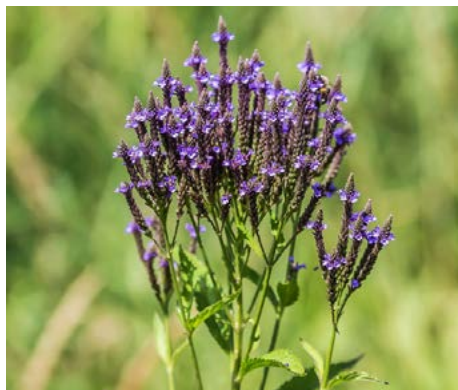
Verbena hastata Blue Vervain

HEIGHT: 2' to 4' TYPE: Broadleaf Perennial HARDINESS: Zone 3 to 8 BLOOM COLOR: Purple BLOOM PERIOD: July to September NATIVE: Yes