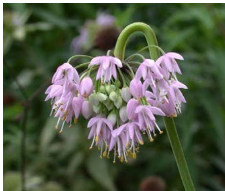
Allium cernuum Nodding Pink Onion

HEIGHT: 1' TYPE: Broadleaf Perennial HARDINESS: Zone 4 to 8 BLOOM COLOR: Pink BLOOM PERIOD: June to July NATIVE: Yes