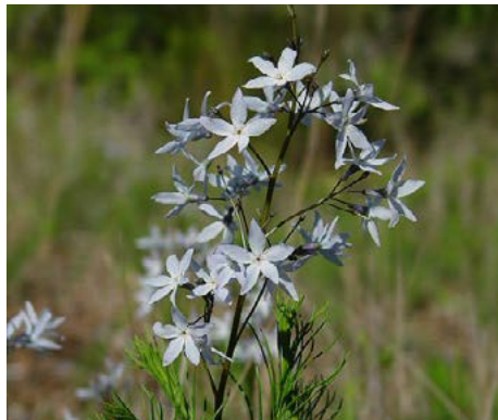
Amsonia ciliata Fringed Bluestar

HEIGHT: 2' TYPE: Broadleaf Perennial HARDINESS: Zone 5 to 9 BLOOM COLOR: Pale Blue BLOOM PERIOD: May to June NATIVE: Yes ATTRIBUTE: Yellow Fall Color