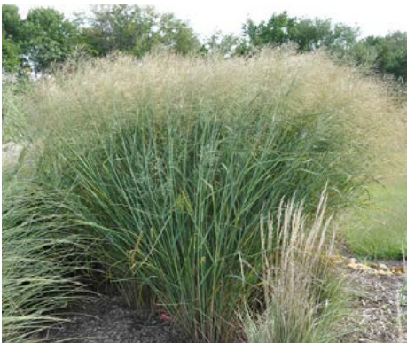
LOCATION: Northern Buffer