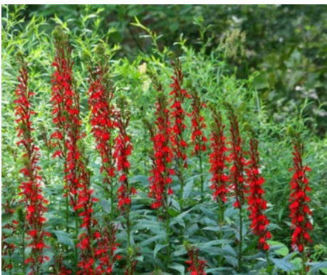
LOCATION: Rain Gardens

HEIGHT: 3' to 4' TYPE: Broadleaf Perennial HARDINESS: Zone 3 to 9 BLOOM COLOR: Blue Violet BLOOM PERIOD: May to July NATIVE: Yes