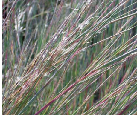
Andropogon gerardii Big Bluestem

HEIGHT: 5' to 8' TYPE: Grass HARDINESS: Zone 4 to 9 BLOOM COLOR: Purplish Red BLOOM PERIOD: August to September FALL LEAF COLOR: Reddish Bronze NATIVE: Yes