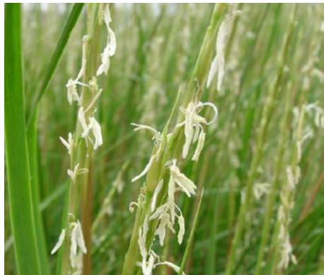
Spartina alterniflora Smooth Cordgrass

HEIGHT: 2' to 8' TYPE: Grass HARDINESS: Zone 5 to 9 BLOOM COLOR: Yellow BLOOM PERIOD: June to October FALL LEAF COLOR: Yellow Orange NATIVE: Yes