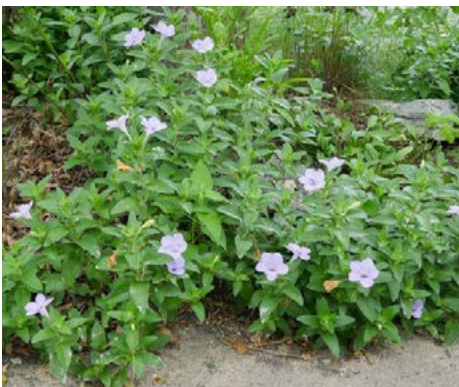
LOCATION: Path Edge, Path Islands, Southwest Shore, Spiral Viewing

HEIGHT: 2' to 3' TYPE: Broadleaf Perennial HARDINESS: Zone 4 to 8 BLOOM COLOR: White BLOOM PERIOD: July to September NATIVE: Yes