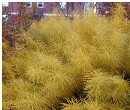
Amsonia hubrichtii Threadleaf Bluestar

HEIGHT: 3' TYPE: Broadleaf Perennial HARDINESS: Zone 5 to 8 BLOOM COLOR: Pale Blue BLOOM PERIOD: May to June NATIVE: Yes ATTRIBUTE: Yellow Fall Color