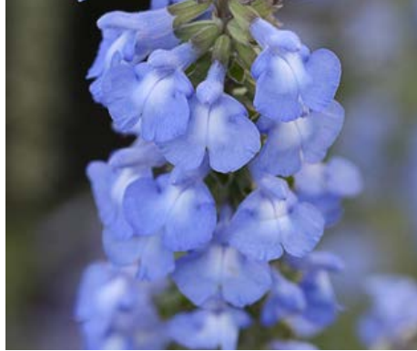
Salvia azurea Azure Blue Sage

HEIGHT: 2' to 5' TYPE: Broadleaf Perennial HARDINESS: Zone 5 to 9 BLOOM COLOR: Blue BLOOM PERIOD: July to September NATIVE: Yes