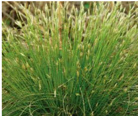
Carex eburnea Bristleleaf Sedge

HEIGHT: 6" TYPE: Sedge HARDINESS: Zone 2 to 8 BLOOM COLOR: Green BLOOM PERIOD: April to May FALL LEAF COLOR: Green NATIVE: Yes