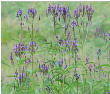
LOCATION: Rain Gardens

HEIGHT: 2' to 3' TYPE: Broadleaf Perennial HARDINESS: Zone 4 to 9 BLOOM COLOR: Blue Violet BLOOM PERIOD: May to June NATIVE: Yes