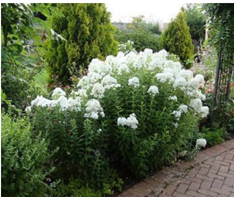
LOCATION: Rolling Dunescape

HEIGHT: 2' to 3' TYPE: Broadleaf Perennial HARDINESS: Zone 3 to 8 BLOOM COLOR: White BLOOM PERIOD: June to July NATIVE: Native Cultivar