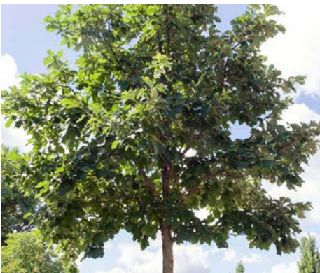
LOCATION: Andre Brook