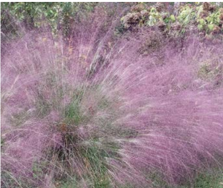
LOCATION: Path Edge, Southwest Shore