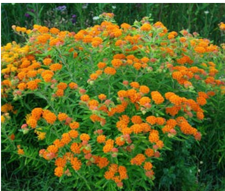
LOCATION: Andre Brook, Rolling Dunescape, Path Islands, Southwest Shore, Main Entry

HEIGHT: 2' to 4' TYPE: Broadleaf Perennial HARDINESS: Zone 3 to 6 BLOOM COLOR: Pink BLOOM PERIOD: June to August NATIVE: Yes