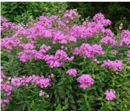
LOCATION: Rolling Dunescape

HEIGHT: 2' to 3' TYPE: Broadleaf Perennial HARDINESS: Zone 4 to 8 BLOOM COLOR: Pink BLOOM PERIOD: July to September NATIVE: Native Cultivar