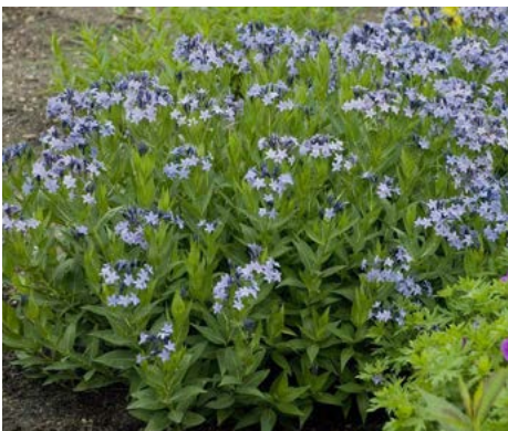
LOCATION: Bulkhead Mantle

HEIGHT: 3' to 4' TYPE: Broadleaf Perennial HARDINESS: Zone 3 to 9 BLOOM COLOR: Pale Blue BLOOM PERIOD: May to June NATIVE: Yes ATTRIBUTE: Yellow Fall Color