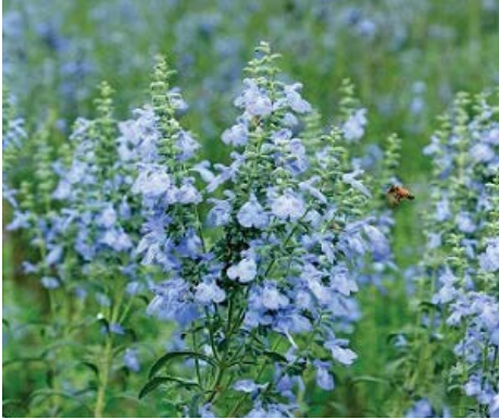
LOCATION: Andre Brook, Rolling Dunescape