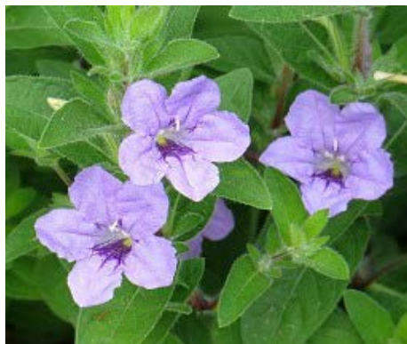
Ruellia humilis Fringeleaf Wild Petunia

HEIGHT: 1' TYPE: Broadleaf Perennial HARDINESS: Zone 4 to 8 BLOOM COLOR: Purple BLOOM PERIOD: June to August NATIVE: Yes