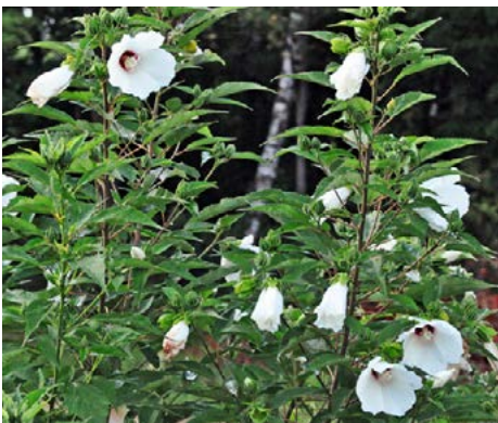
LOCATION: Andre Brook

HEIGHT: 10" to 18" TYPE: Broadleaf Perennial HARDINESS: Zone 3 to 8 BLOOM COLOR: White BLOOM PERIOD: July to October NATIVE: Native Cultivar