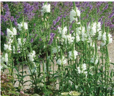
LOCATION: Rain Gardens

HEIGHT: 6" TYPE: Broadleaf Perennial HARDINESS: Zone 3 to 9 BLOOM COLOR: Lavender Pink BLOOM PERIOD: April to June NATIVE: Yes