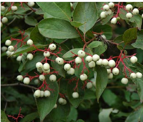
LOCATION: Path Edge, Rain Gardens