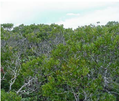
LOCATION: Path Edge, Rolling Dunescape