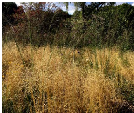
Deschampsia cespitosa Tufted Hairgrass

HEIGHT: 1' to 2' TYPE: Grass HARDINESS: Zone 4 to 9 BLOOM COLOR: Green BLOOM PERIOD: June to July FALL LEAF COLOR: Yellow NATIVE: Yes