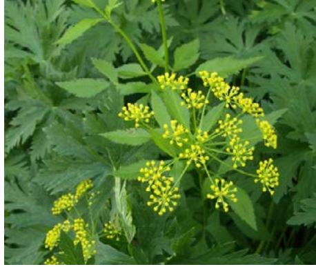
Zizia aurea Golden Alexander