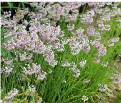
LOCATION: Andre Brook, Path Edge, Path Islands, Main Entrance, Spiral Viewing

HEIGHT: 2' to 5' TYPE: Broadleaf Perennial HARDINESS: Zone 4 to 8 BLOOM COLOR: Purple BLOOM PERIOD: June to September NATIVE: Yes ATTRIBUTE: Fragrant