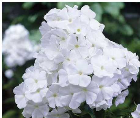
Phlox paniculata 'David' Summer Phlox

HEIGHT: 2' to 5' TYPE: Broadleaf Perennial HARDINESS: Zone 3 to 8 BLOOM COLOR: White BLOOM PERIOD: July to September NATIVE: Native Cultivar