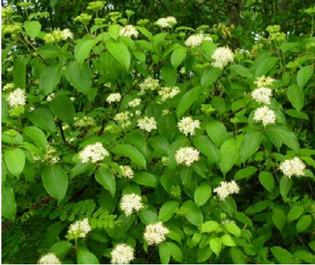
LOCATION: Rain Gardens