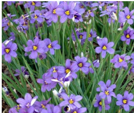
Sisyrinchium angustifolium 'Lucerne' Stout Blue-Eyed Grass

HEIGHT: 6" to 12" TYPE: Broadleaf Perennial HARDINESS: Zone 4 to 8 BLOOM COLOR: Blue BLOOM PERIOD: May to June NATIVE: Native Cultivar