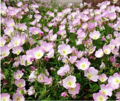
LOCATION: Pathway Edge