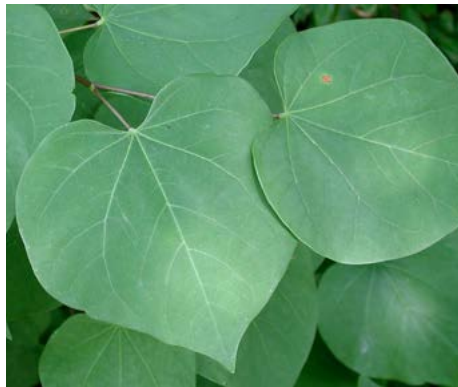
Cercis canadensis Eastern Redbud existing

HEIGHT: 20' to 30' TYPE: Deciduous Tree HARDINESS: Zone 4 to 8 BLOOM COLOR: Pink BLOOM PERIOD: April to May FALL LEAF COLOR: Orange NATIVE: Yes ATTRIBUTES: Flowers before Leaf Out