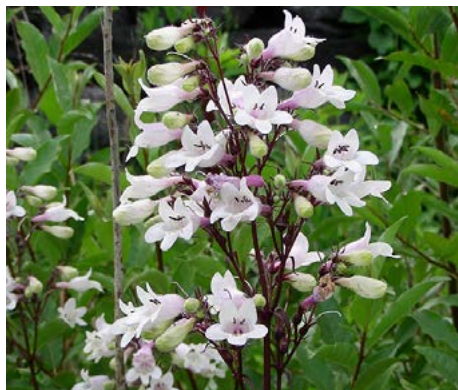
Penstemon digitalis 'Huskers Red' White Beardtongue

HEIGHT: 2' to 4' TYPE: Broadleaf Perennial HARDINESS: Zone 3 to 8 BLOOM COLOR: White BLOOM PERIOD: June to July NATIVE: Native Cultivar ATTRIBUTE: Maroon Foliage