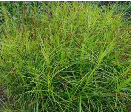
LOCATION: Rain Gardens

HEIGHT: 6" to 8" TYPE: Sedge HARDINESS: Zone 4 to 7 BLOOM COLOR: Green BLOOM PERIOD: May to June FALL LEAF COLOR: Green NATIVE: Yes