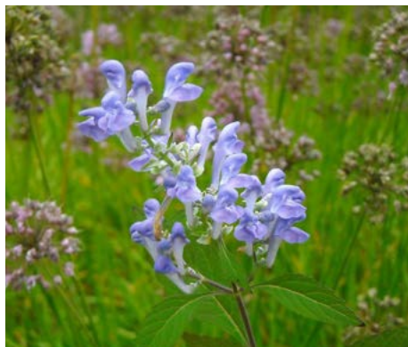
Scutellaria incana Downy Skullcap

HEIGHT: 2' to 3' TYPE: Broadleaf Perennial HARDINESS: Zone 5 to 8 BLOOM COLOR: Blue BLOOM PERIOD: July to September NATIVE: Yes