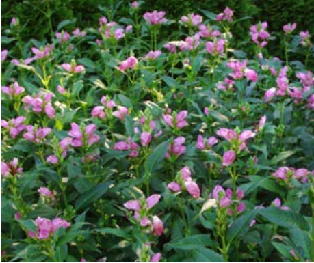
LOCATION: Rain Gardens