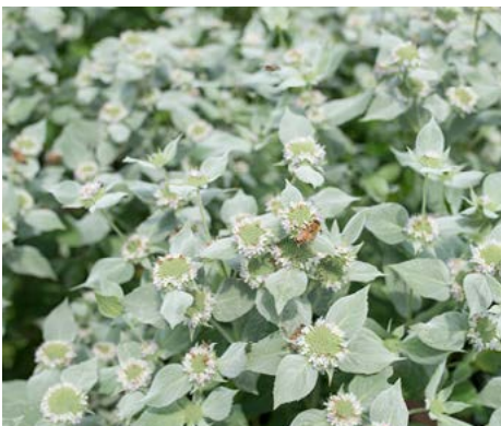
LOCATION: Andre Brook, Rain Gardens, Pathway Islands

HEIGHT: 3' to 4' TYPE: Broadleaf Perennial HARDINESS: Zone 4 to 8 BLOOM COLOR: White BLOOM PERIOD: July to September NATIVE: Yes