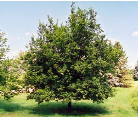
LOCATION: Main Entry

HEIGHT: 15' to 20' TYPE: Evergreen Tree HARDINESS: Zone 3 to 9 BLOOM COLOR: Non-Flowering BLOOM PERIOD: Non-Flowering FALL LEAF COLOR: Green NATIVE: Native Cultivar ATTRIBUTES: Blue Berries in Fall