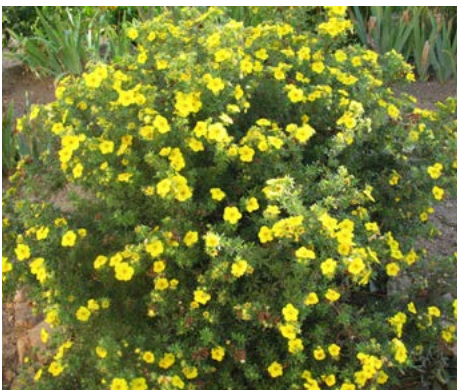
LOCATION: Andre Brook, Rolling Dunescape