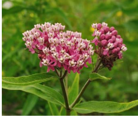
Asclepias incarnata Swamp Milkweed

HEIGHT: 2' to 4' TYPE: Broadleaf Perennial HARDINESS: Zone 3 to 6 BLOOM COLOR: Pink BLOOM PERIOD: June to August NATIVE: Yes