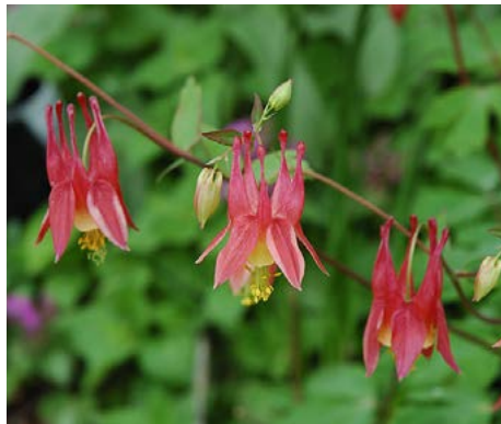
Aquilegia canadensis Columbine

HEIGHT: 1' to 2' TYPE: Broadleaf Perennial HARDINESS: Zone 3 to 8 BLOOM COLOR: Yellow to Red BLOOM PERIOD: May to July NATIVE: Yes