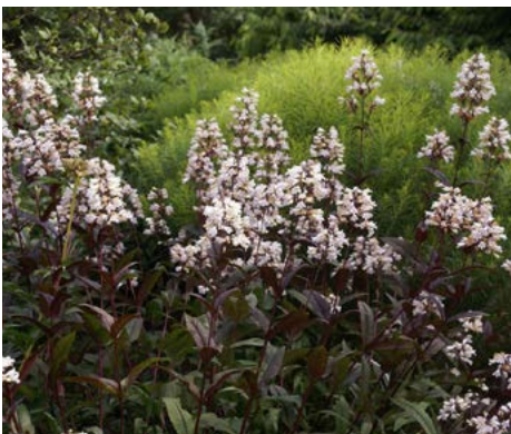
LOCATION: Andre Brook, Rolling Dunescape, Bulkhead Mantle

HEIGHT: 2' to 3' TYPE: Broadleaf Perennial HARDINESS: Zone 4 to 9 BLOOM COLOR: White to Pink BLOOM PERIOD: May to July NATIVE: Yes