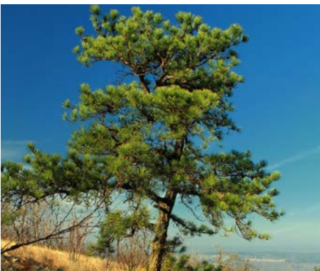
LOCATION: Path Edge, Rolling Dunescape, Rain Gardens

HEIGHT: 35' to 50' TYPE: Deciduous Tree HARDINESS: Zone 3 to 9 BLOOM COLOR: Red Brown BLOOM PERIOD: May FALL LEAF COLOR: Yellow Orange NATIVE: Yes ATTRIBUTES: Exfoliating Bark