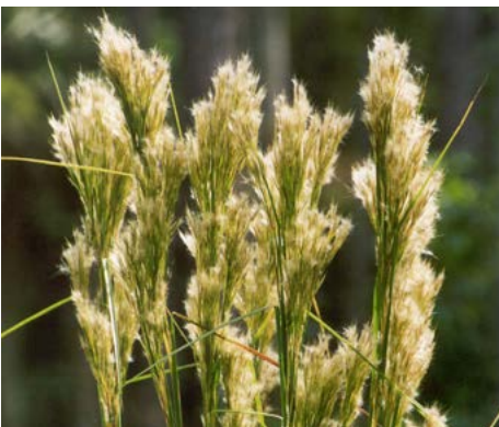
LOCATION: Rolling Gardens

HEIGHT: 5' to 8' TYPE: Grass HARDINESS: Zone 4 to 9 BLOOM COLOR: Purplish Red BLOOM PERIOD: August to September FALL LEAF COLOR: Reddish Bronze NATIVE: Yes