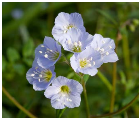
Polemonium reptans Jacobs Ladder

HEIGHT: 12" to 14" TYPE: Broadleaf Perennial HARDINESS: Zone 3 to 8 BLOOM COLOR: Blue BLOOM PERIOD: May to June NATIVE: Yes