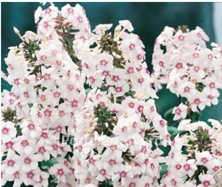
LOCATION: Rolling Dunescape

HEIGHT: 2' to 4' TYPE: Broadleaf Perennial HARDINESS: Zone 3 to 8 BLOOM COLOR: White BLOOM PERIOD: June to July NATIVE: Native Cultivar ATTRIBUTE: Maroon Foliage