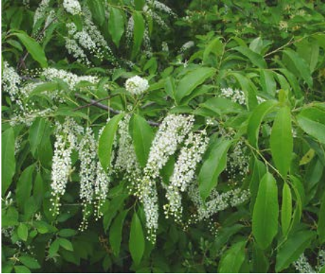
LOCATION: Path Edge