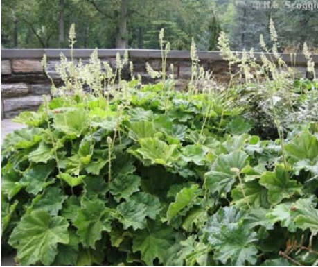
LOCATION: Main Entry