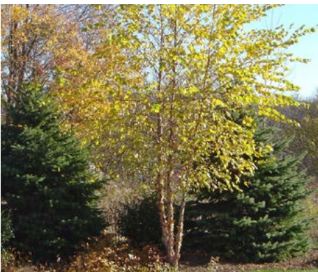
LOCATION: Northern Buffer

HEIGHT: 25' to 35' TYPE: Deciduous Tree HARDINESS: Zone 4 to 8 BLOOM COLOR: White BLOOM PERIOD: April to May FALL LEAF COLOR: Orange NATIVE: Yes