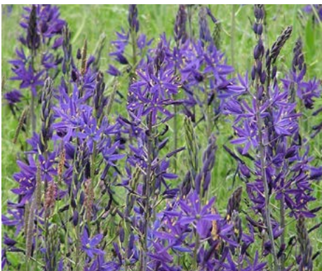
LOCATION: Rain Gardens

HEIGHT: 1' to 2' TYPE: Broadleaf Perennial HARDINESS: Zone 4 to 8 BLOOM COLOR: Pink BLOOM PERIOD: June to August NATIVE: Yes