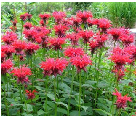
LOCATION: Andre Brooke

HEIGHT: 2' to 3' TYPE: Broadleaf Perennial HARDINESS: Zone 3 to 8 BLOOM COLOR: Yellow to Pink BLOOM PERIOD: July to September NATIVE: Yes