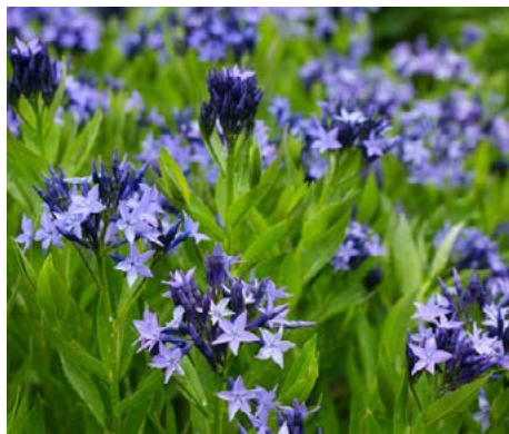
Amsonia x 'Blue Ice' Blue Star Flower

HEIGHT: 10" TYPE: Broadleaf Perennial HARDINESS: Zone 4 to 9 BLOOM COLOR: Lavender Blue BLOOM PERIOD: May to June NATIVE: Native Cultivar ATTRIBUTE: Yellow Fall Color