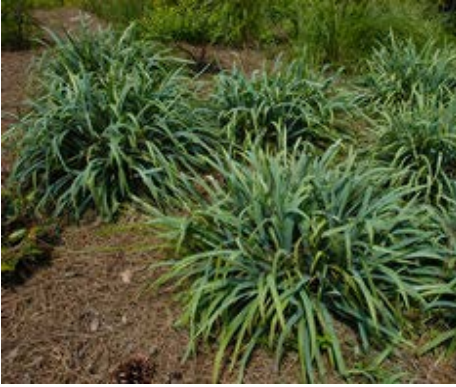
LOCATION: Picnic Grove