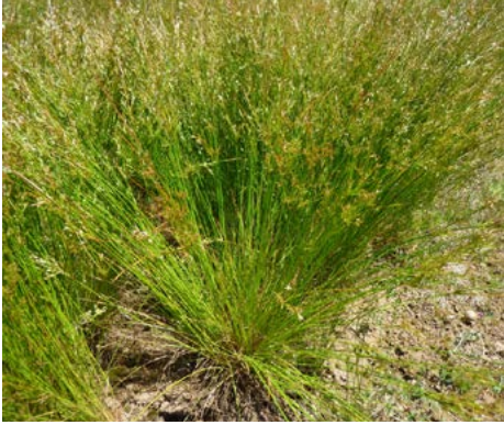
LOCATION: Andre Brook