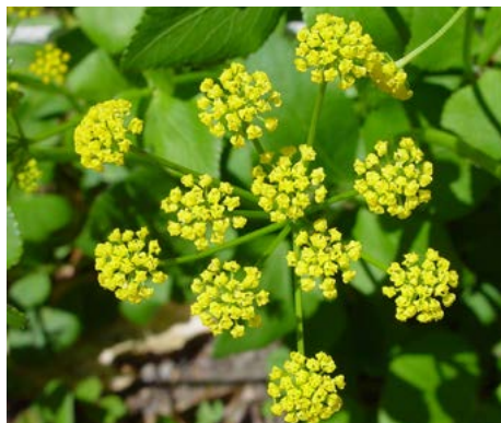
Zizia aptera Heart-Leaf Golden Alexander

HEIGHT: 1' to 2' TYPE: Broadleaf Perennial HARDINESS: Zone 3 to 8 BLOOM COLOR: Yellow BLOOM PERIOD: May NATIVE: Yes