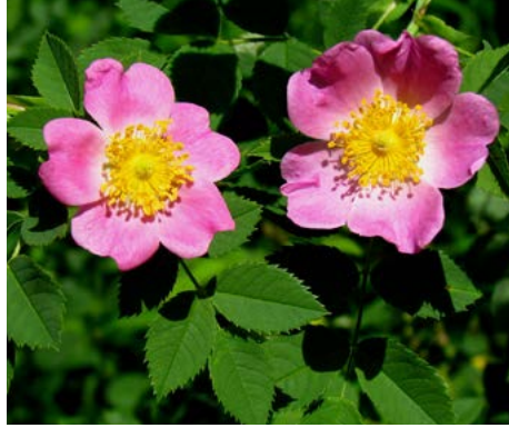
Rosa carolina Fragrant Sumac