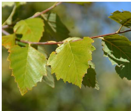
Betula nigra River Birch existing

HEIGHT: 50' to 75' TYPE: Deciduous Tree HARDINESS: Zone 4 to 9 BLOOM COLOR: Yellow Green BLOOM PERIOD: April to May FALL LEAF COLOR: Yellow NATIVE: Yes