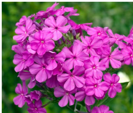
Phlox paniculata 'Robert Poore' Summer Phlox

HEIGHT: 2' to 5' TYPE: Broadleaf Perennial HARDINESS: Zone 5 to 9 BLOOM COLOR: Pink BLOOM PERIOD: August to September NATIVE: Native Cultivar