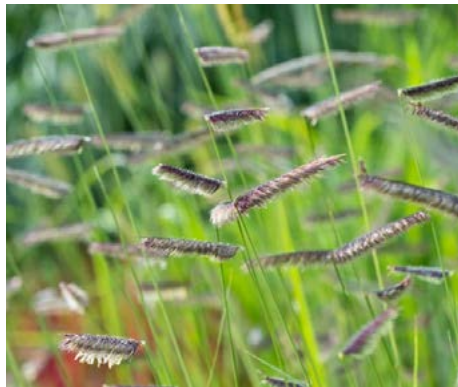
Bouteloua gracilis Blue Grama Grass

HEIGHT: 8" to 15" TYPE: Grass HARDINESS: Zone 3 to 10 BLOOM COLOR: Tan BLOOM PERIOD: June to September FALL LEAF COLOR: Orange NATIVE: Yes