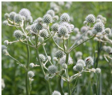
Eryngium yuccifolium Rattlesnake Master

HEIGHT: 2' to 3' TYPE: Broadleaf Perennial HARDINESS: Zone 3 to 8 BLOOM COLOR: White BLOOM PERIOD: July to August NATIVE: Yes