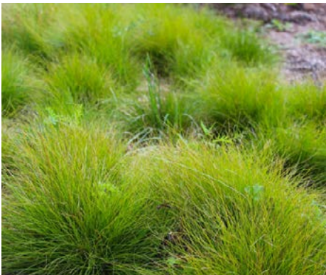
LOCATION: Picnic Grove, Main Entry

HEIGHT: 1' to 3' TYPE: Sedge HARDINESS: Zone 3 to 8 BLOOM COLOR: Green BLOOM PERIOD: May to June FALL LEAF COLOR: Green NATIVE: Yes