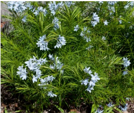
LOCATION: Rolling Dunescape, Path Islands, Bulkhead Mantle

HEIGHT: 1' TYPE: Broadleaf Perennial HARDINESS: Zone 4 to 8 BLOOM COLOR: Pink BLOOM PERIOD: June to July NATIVE: Yes