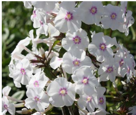
Phlox maculata 'Omega' Omega Spotted Phlox

HEIGHT: 2' to 3' TYPE: Broadleaf Perennial HARDINESS: Zone 3 to 8 BLOOM COLOR: White BLOOM PERIOD: June to July NATIVE: Native Cultivar