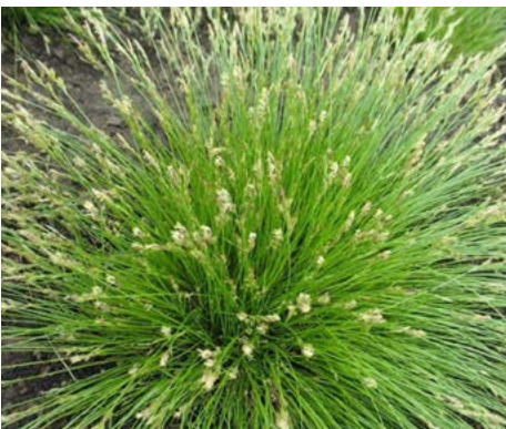
LOCATION: Andre Brook

HEIGHT: 8" to 15" TYPE: Grass HARDINESS: Zone 3 to 10 BLOOM COLOR: Tan BLOOM PERIOD: June to September FALL LEAF COLOR: Orange NATIVE: Yes