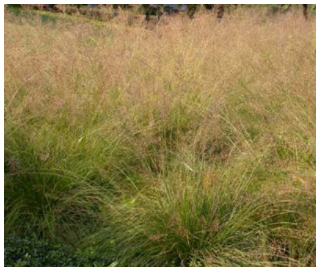
Sporobolus heterolepis Switchgrass

HEIGHT: 2' to 3' TYPE: Grass HARDINESS: Zone 3 to 9 BLOOM COLOR: Pinkish Brown BLOOM PERIOD: August to October FALL LEAF COLOR: Yellow Bronze NATIVE: Yes