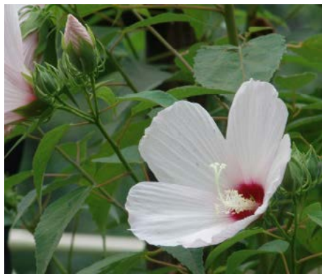
Hibiscus moscheutos Rose Mallow

HEIGHT: 4' to 7' TYPE: Broadleaf Perennial HARDINESS: Zone 5 to 8 BLOOM COLOR: White to Pink BLOOM PERIOD: July to September NATIVE: Yes