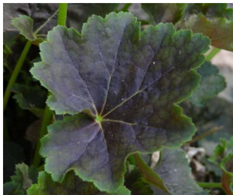
Heuchera americana 'Garnet' American Alumroot

HEIGHT: 1' - 2' TYPE: Broadleaf Perennial HARDINESS: Zone 4 to 8 BLOOM COLOR: Greenish White BLOOM PERIOD: May NATIVE: Native Cultivar