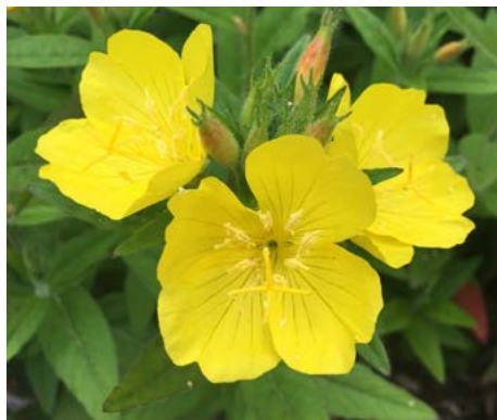
Oenothera fruticosa Sundrops

HEIGHT: 2' to 3' TYPE: Broadleaf Perennial HARDINESS: Zone 4 to 9 BLOOM COLOR: Yellow BLOOM PERIOD: May to June NATIVE: Yes