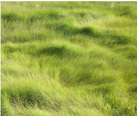
LOCATION: Andre Brook

HEIGHT: 2' to 8' TYPE: Grass HARDINESS: Zone 5 to 9 BLOOM COLOR: Yellow BLOOM PERIOD: June to October FALL LEAF COLOR: Yellow Orange NATIVE: Yes