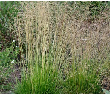
LOCATION: Andrew Brook

HEIGHT: 4' TYPE: Grass HARDINESS: Zone 3 to 8 BLOOM COLOR: Purple Bronze BLOOM PERIOD: July to September FALL LEAF COLOR: Copper NATIVE: Yes