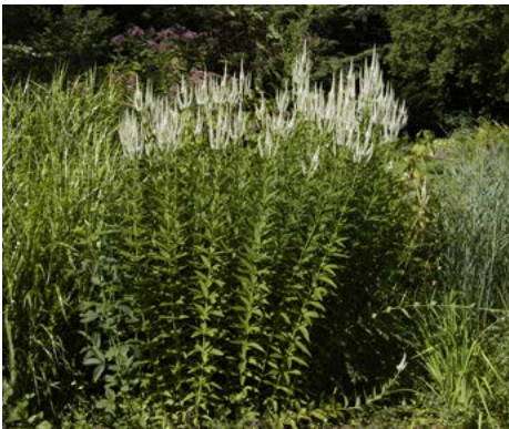
LOCATION: Rolling Dunescape, Northern Buffer

HEIGHT: 2' to 4' TYPE: Broadleaf Perennial HARDINESS: Zone 3 to 8 BLOOM COLOR: Purple BLOOM PERIOD: July to September NATIVE: Yes