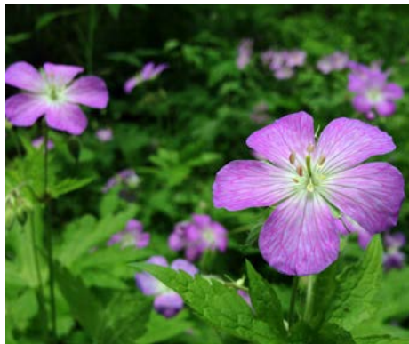
Geranium maculatum Wild Geranium

HEIGHT: 1' TYPE: Broadleaf Perennial HARDINESS: Zone 3 to 8 BLOOM COLOR: Pink BLOOM PERIOD: May to June NATIVE: Yes