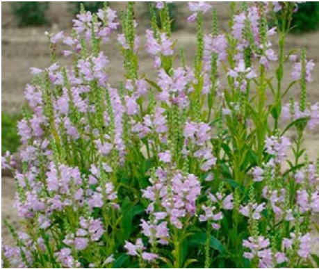
LOCATION: Rain Gardens