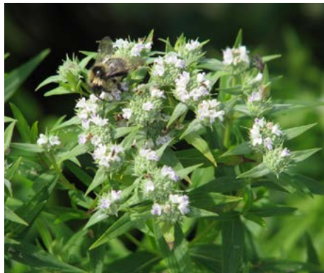
Pycnanthemum tenuifolium Slender Mountain Mint

HEIGHT: 2' to 3' TYPE: Broadleaf Perennial HARDINESS: Zone 4 to 8 BLOOM COLOR: White BLOOM PERIOD: July to September NATIVE: Yes