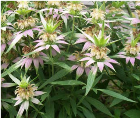
LOCATION: Rolling Dunescape