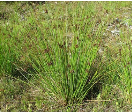
LOCATION: Rain Gardens