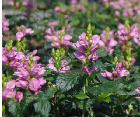
Chelone lyonii 'Hot Lips' Pink Turtlehead

HEIGHT: 3' TYPE: Broadleaf Perennial HARDINESS: Zone 3 to 8 BLOOM COLOR: Pink BLOOM PERIOD: August to September NATIVE: Native Cultivar