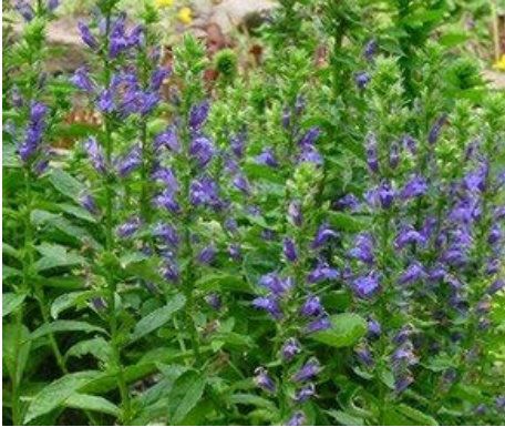
LOCATION: Rain Gardens