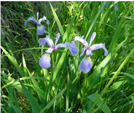
LOCATION: Rain Gardens

HEIGHT: 4' to 7' TYPE: Broadleaf Perennial HARDINESS: Zone 5 to 8 BLOOM COLOR: White to Pink BLOOM PERIOD: July to September NATIVE: Yes