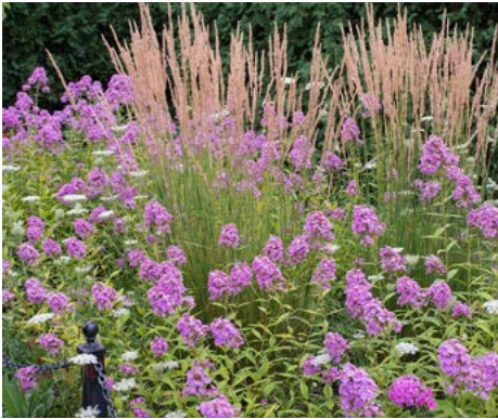
LOCATION: Rolling Dunescape