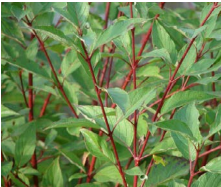
LOCATION: Andre Brook, Path Edge, Rolling Dunescape, Rain Gardens