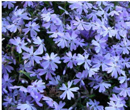
Phlox subulata Moss Pink

HEIGHT: 6" TYPE: Broadleaf Perennial HARDINESS: Zone 3 to 9 BLOOM COLOR: Lavender Pink BLOOM PERIOD: April to June NATIVE: Yes