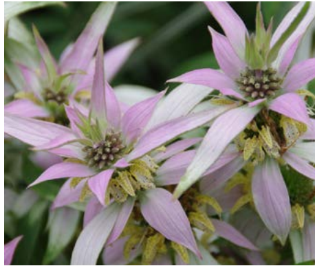
Monarda punctata Horsemint

HEIGHT: 2' to 3' TYPE: Broadleaf Perennial HARDINESS: Zone 3 to 8 BLOOM COLOR: Yellow to Pink BLOOM PERIOD: July to September NATIVE: Yes