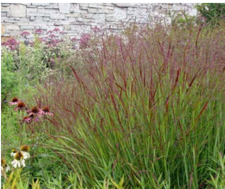
LOCATION: Spiral Viewing