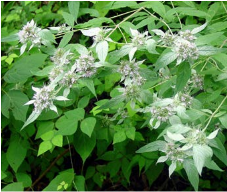
LOCATION: Main Entry, Northern Buffer