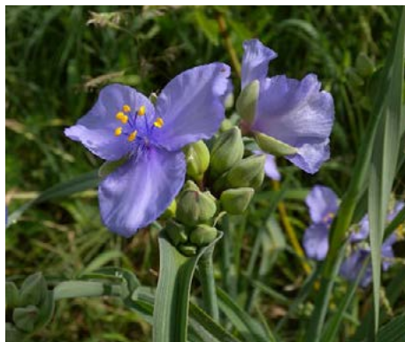
Tradescantia ohiensis Ohio Spiderwort

HEIGHT: 2' to 3' TYPE: Broadleaf Perennial HARDINESS: Zone 4 to 9 BLOOM COLOR: Blue BLOOM PERIOD: May to June NATIVE: Yes