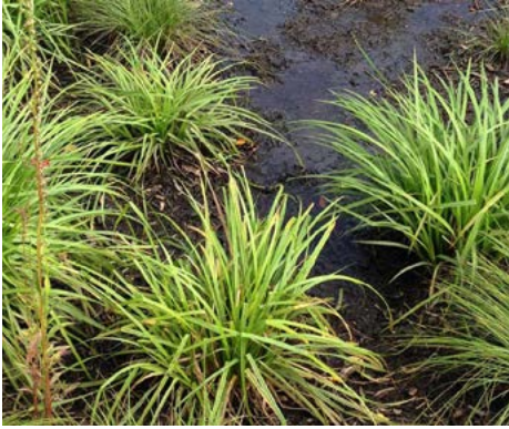
LOCATION: Rain Gardens