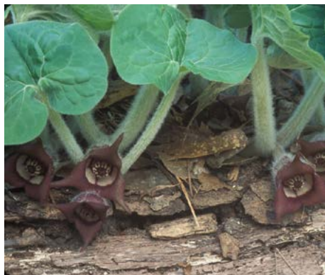
Asarum canadense Wild Ginger

HEIGHT: 6" to 8" TYPE: Broadleaf Perennial HARDINESS: Zone 4 to 6 BLOOM COLOR: Purplish Brown BLOOM PERIOD: April to May NATIVE: Yes