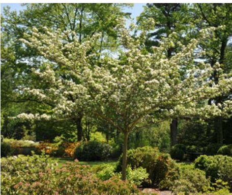
LOCATION: Andre Brook

HEIGHT: 20' to 30' TYPE: Deciduous Tree HARDINESS: Zone 4 to 8 BLOOM COLOR: Pink BLOOM PERIOD: April to May FALL LEAF COLOR: Orange NATIVE: Yes ATTRIBUTES: Flowers before Leaf Out