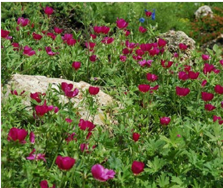
LOCATION: Path Edge, Spiral Viewing

HEIGHT: 2' to 3' TYPE: Broadleaf Perennial HARDINESS: Zone 3 to 9 BLOOM COLOR: Orange BLOOM PERIOD: June to July NATIVE: Yes