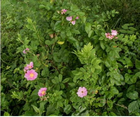
LOCATION: Path Edge, Rolling Dunescape, Rain Gardens