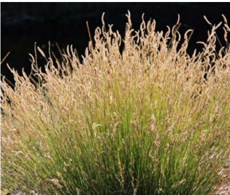
LOCATION: Andre Brook, Path Edge

HEIGHT: 2' to 4' TYPE: Grass HARDINESS: Zone 5 to 9 BLOOM COLOR: White BLOOM PERIOD: September FALL LEAF COLOR: Coppery Orange NATIVE: Yes