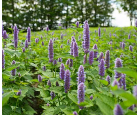
Agastache foeniculum Anise Hyssop

HEIGHT: 2' to 5' TYPE: Broadleaf Perennial HARDINESS: Zone 4 to 8 BLOOM COLOR: Purple BLOOM PERIOD: June to September NATIVE: Yes ATTRIBUTE: Fragrant