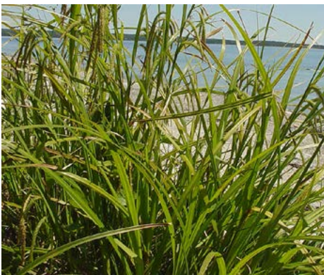
LOCATION: Rain Gardens

HEIGHT: 2' to 3' TYPE: Sedge HARDINESS: Zone 4 to 8 BLOOM COLOR: Green BLOOM PERIOD: July to August FALL LEAF COLOR: Green NATIVE: Yes