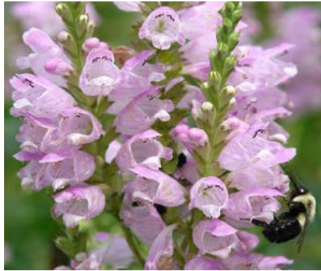
Physostegia virginiana 'Pink Manners' Obedient Plant

HEIGHT: 2' to 4' TYPE: Broadleaf Perennial HARDINESS: Zone 3 to 9 BLOOM COLOR: Pink BLOOM PERIOD: July to October NATIVE: Native Cultivar